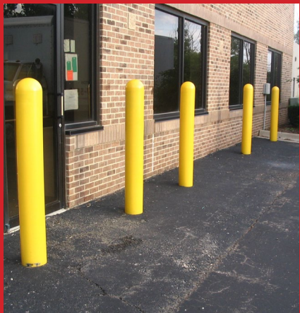
Never Paint Again