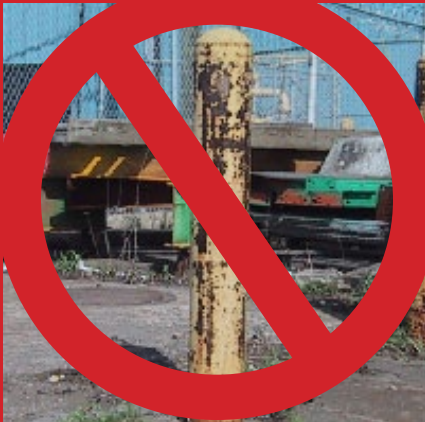
Clean It Up