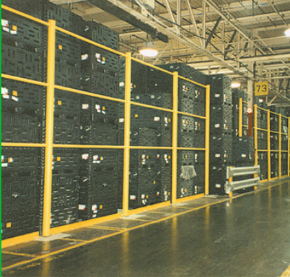
Maximizes Facility Floor Space