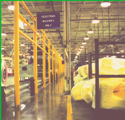
Open Wall for Increased Air Flow