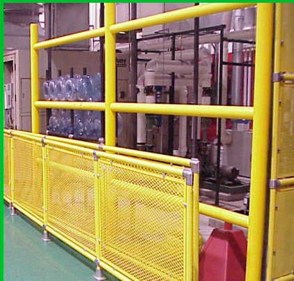
Custom Designed for Your Storage Needs