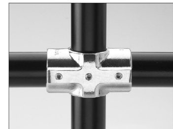
No. 7E Cross